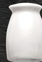
Code:LO-26014 Ø 3.1 x H 4.5 CM