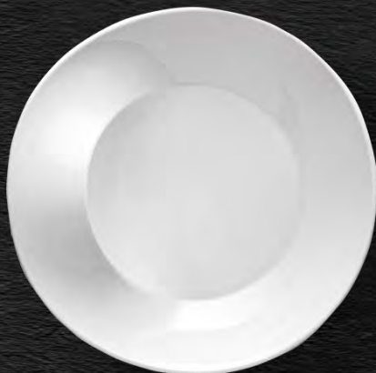
Code: LO-22020 Ø20 CM. 440 cc