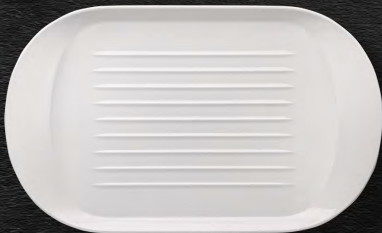
Code: LO-24234 ø 34 x 20.7 CM