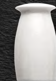
Code:LO-26017 Ø 3.1 x H 7 CM