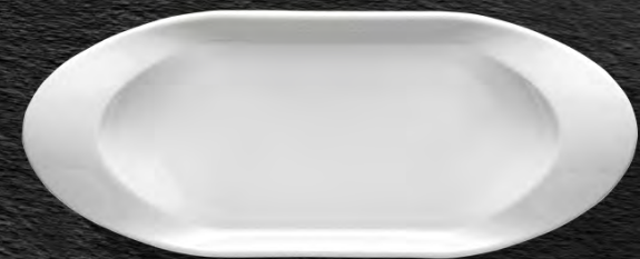
Ø 32 x 15 CM