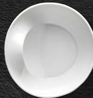
Code: LO-22018 Ø18 CM. 320 cc