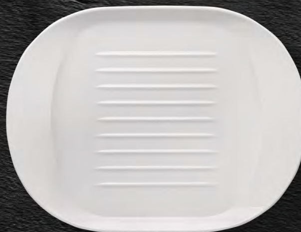
Code: LO-24227 ø 27 x 20.7 CM