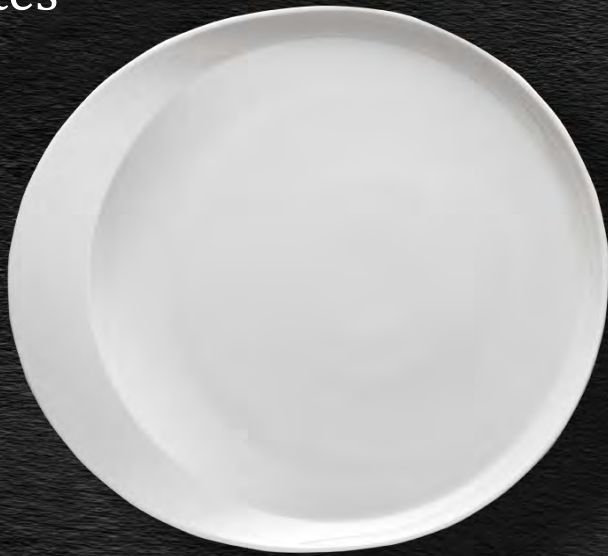
Code: LO-21032 ø 32 cm