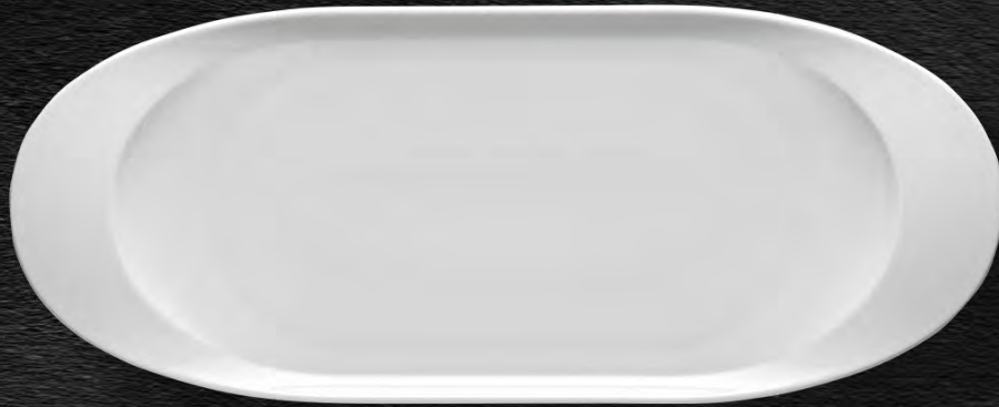
Code: LO-24039 Ø 39 x 16 CM