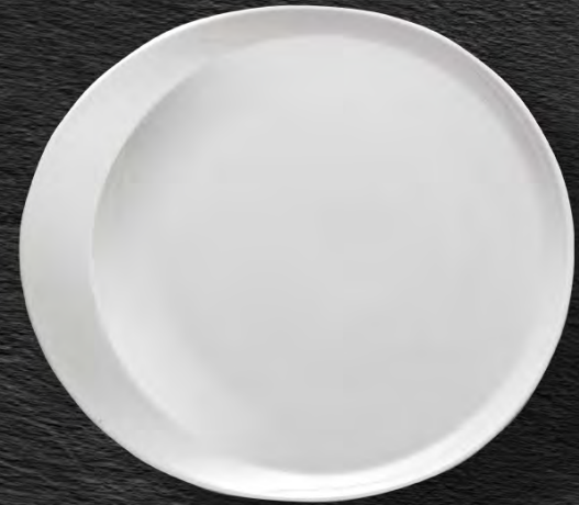
Code: LO-21028 ø 28 cm