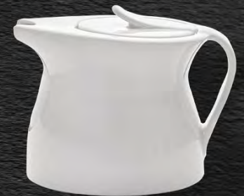
Code: LO-28066 Ø 660 cc.