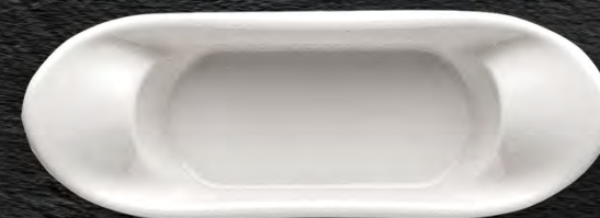
Code:LO-26011 Ø 11.5 x 3.8 CM