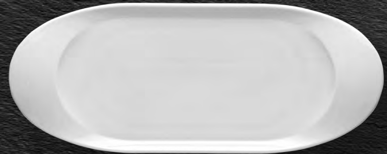
Code: LO-24032 Ø 32 x 13 CM.