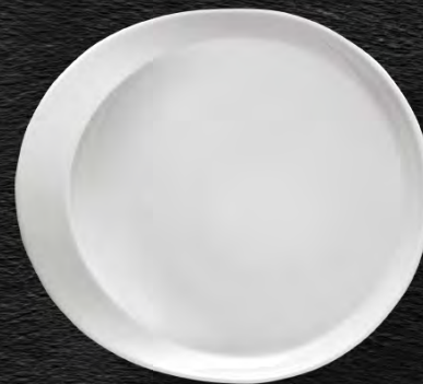
Code: LO-21022 ø 22 cm