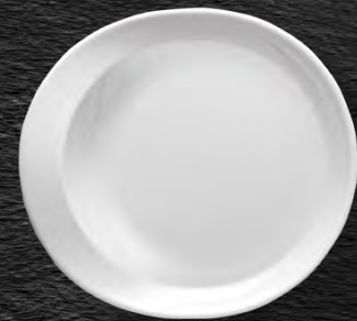
Code: LO-21015 ø 15 cm