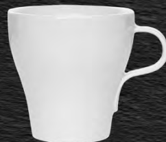
Code: LO-27023 Ø 230 cc.