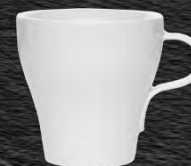
Code: LO-27018 Ø 180 cc.