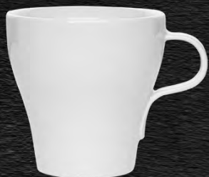
Code: LO-27030 Ø 300 cc.