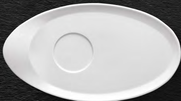
Code: LO-27130 Ø 27 x 16 CM