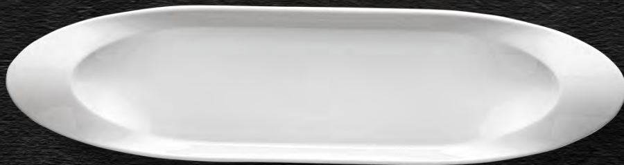
Code: LO-24139 Ø 39 x 10 CM