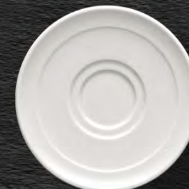
Code: LO-27109 Ø 13 CM